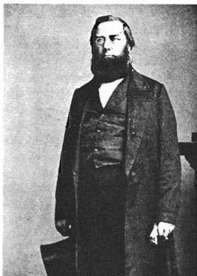
George Perkins Marsh