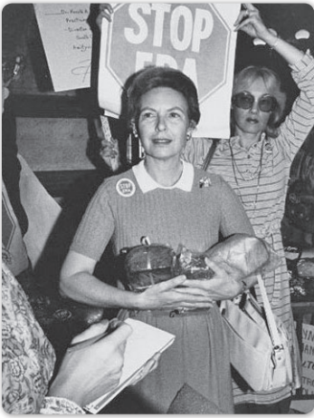
Phyllis Schlafly selling bread to legislators to raise money for STOP ERA, Springfield, Ill., 1980.