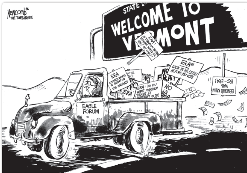
Phyllis Schlafly bringing campaign slogans from STOP ERA to Vermont. Times Argus, November 6, 1986.