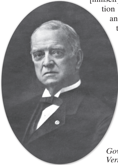
Governor John A. Mead. Vermont Historical Society.

Mead confidently informed the joint assembly of the legislature that state research confirmed that the degenerate class was "increasing