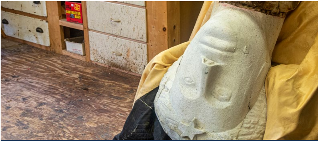
Dwight Dwinell's carved statue of Ceres stood atop the Vermont State House dome from 1938 until 2018, when it was removed and replaced due to extensive damage. After months of conservation work, part of the statue has been preserved and will be on permanent exhibit at the Vermont History Museum starting in October 2019. Here, you can see it while it underwent preservation work in the summer of 2019.