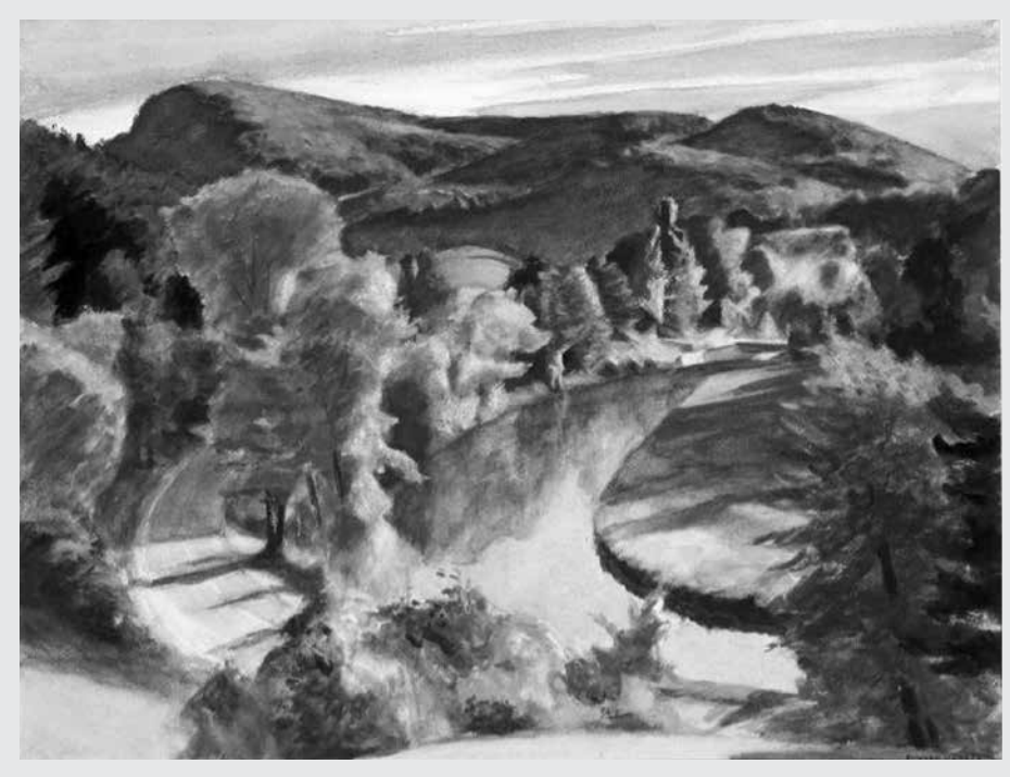
First Branch of the White River, Vermont